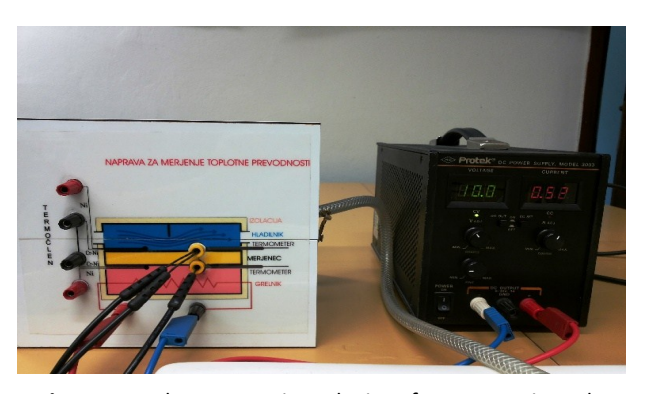
Figure 1. The measuring device for measuring the thermal conductivity of fabric. The heater is connected with constant power supply and through the cooler

During the measurement, we monitor the time variation of the temperature with four surface temperature sensors Vernier that are connected via interface Vernier LabPro with computer software Logger Pro 3. Sensors provide information of temperature at two points on each surface of fabric sample. Because the fabric sample is compressed during the measurement of thermal conductivity, the thickness of the sample is measured under approximately the same conditions at several points with caliper accurate to \pm 0.02 mm.